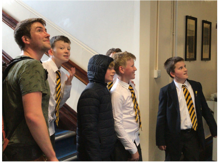
The Siena Climbers looking aspiringly to the summit

To date, the climbers have raised a total of £160 for the Siena House Charity, The Cindy Appleyard Foundation, but more than that, they learned that through cooperation, resilience and perseverance, any peak can be conquered – imaginary or not!