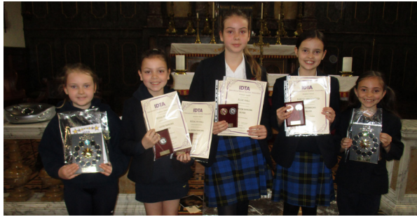
DANCE AWARD WINNERS