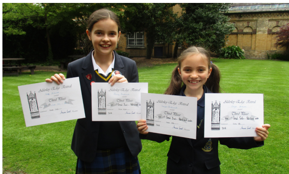
SINGING AWARD WINNERS