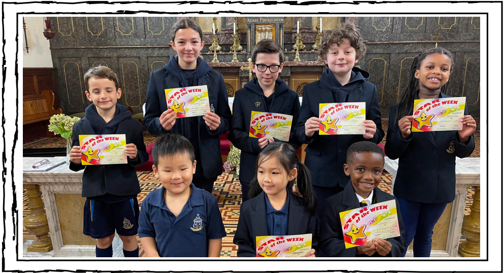
Stars of the Week