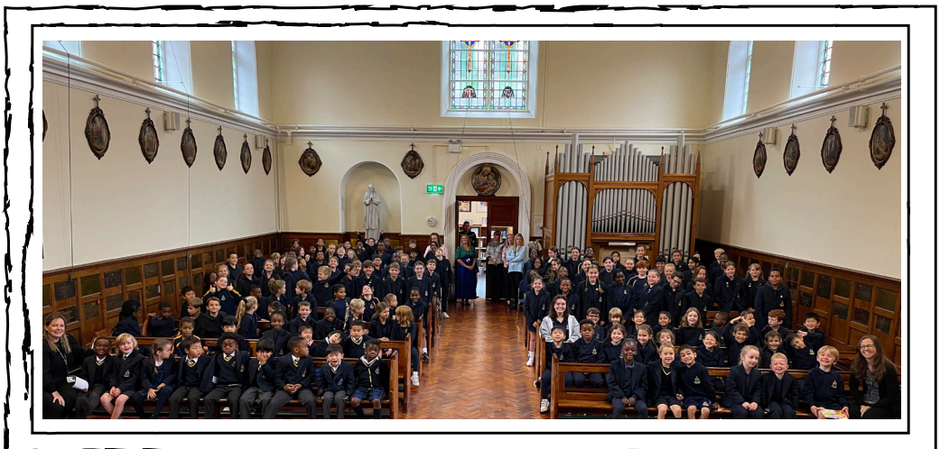
Class of the Week - The Prep